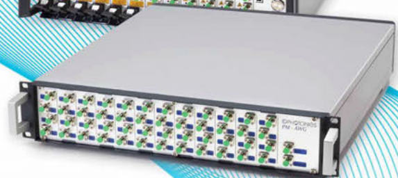
PMUX Polarization Maintaining Multiplexer