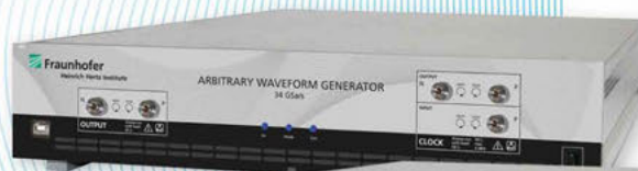
34 GSa/s ARBITRARY WAVEFORM GENERATOR