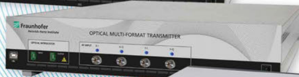
OPTICAL MULTI-FORMAT TRANSMITTER