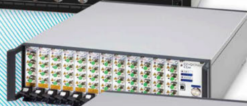
CoBrite MX Highly Scalable Multi Carrier Laser Platform