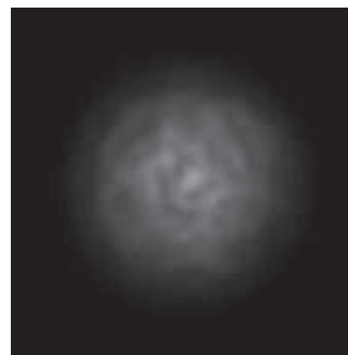
Light source output with Shaker