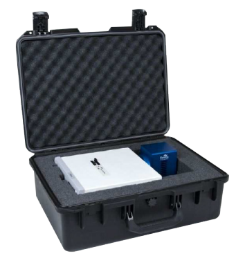
MPX-2 in Carrying Case (Optional)