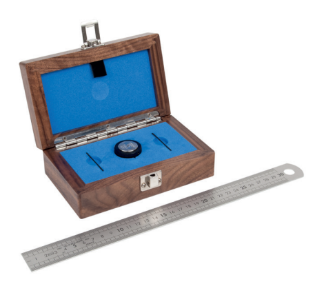
MPX Geometrical Calibration Artefact (Optional)